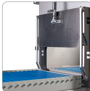
open gate chamber