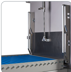
closed gate chamber