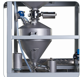
sending bin for product conveyance