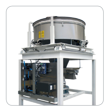
Model with squeeze-type lock for free discharge cross-section.