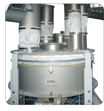
Highly precise weighing as a multi-component model.