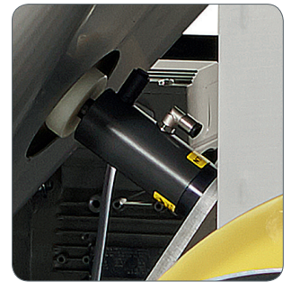
discharge aids pneumatically